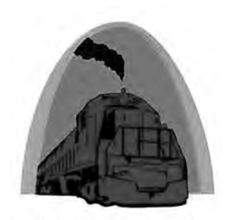
SCHLICHTER BOGARD & DENTON AttorneysatLaw