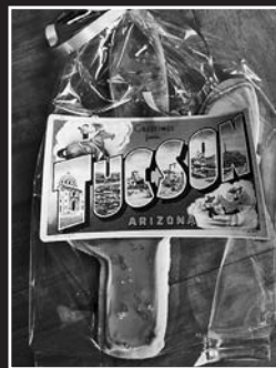
NASLBC Meeting, March 29-31, 2015 Tucson, Arizona