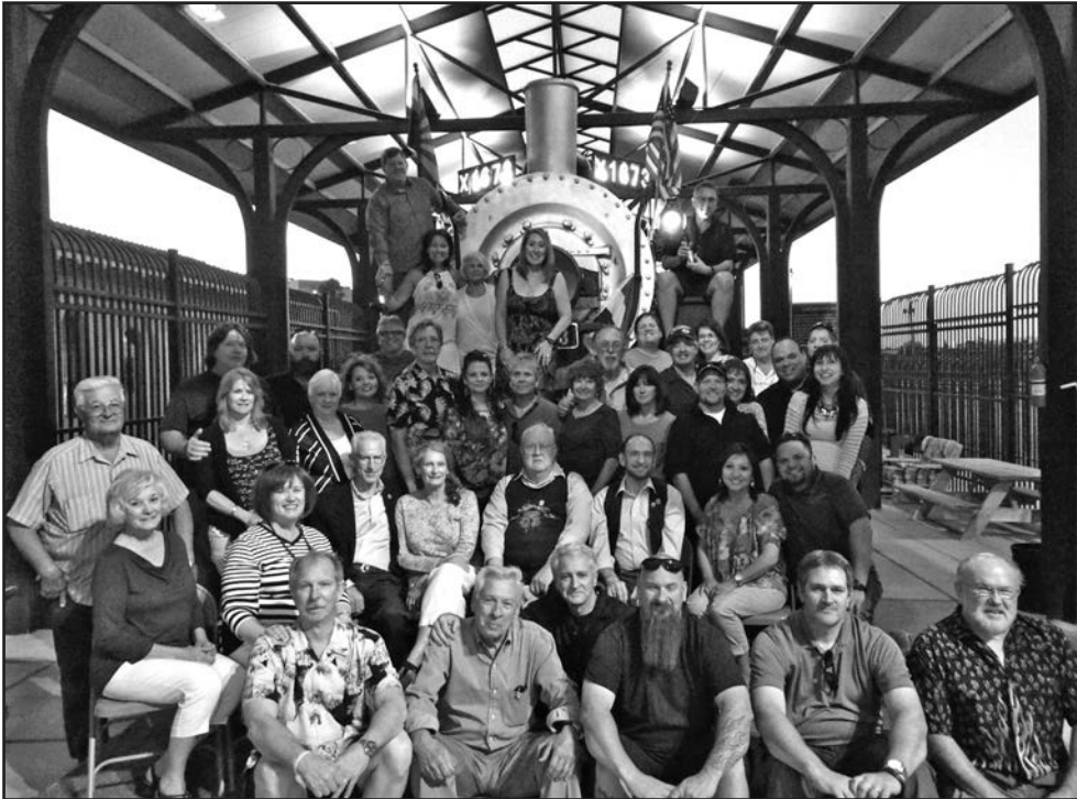
Happy Hour Guests congregated in front of retired Southern Pacific Steam Engine #1673 for a group photo at the Southern Arizona Transportation Museum