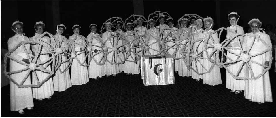
GIA Ritual: GIA members perform the parasol drill during the BLET's Southeastern Meeting Association (SMA) annual convention in 1982.

their mutual protection and in the interest of their loved ones in the BLE. Charitable projects, such as the GIA Orphans Pension Fund and other funds to care for aged and indigent members were established.