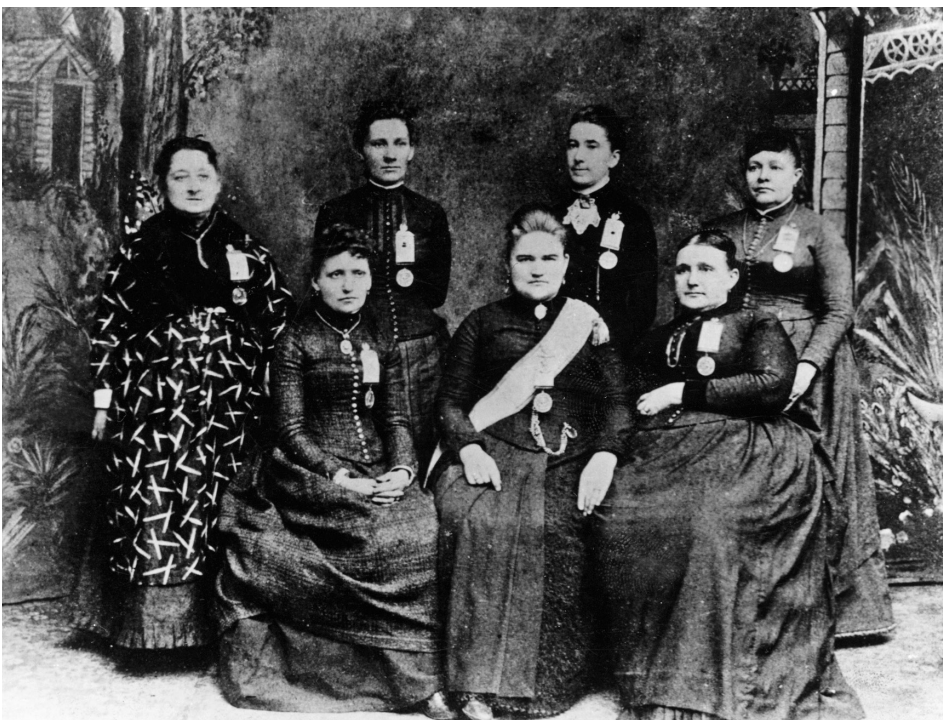
Founding members and first officers of the Grand International Auxiliary (GIA), elected at convention in Chicago, pose for this photo in 1888.

Promoting fraternal love and sociability within the families of BLE members was the main purpose of the GIA. Over the years, these women banded together for