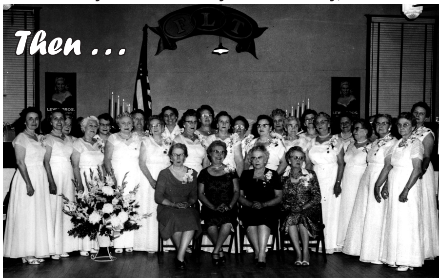
Grand International Auxiliary members and officers in 1959.