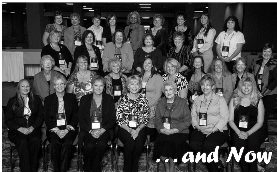
BLET Auxiliary Officers and delegates at the 2010 National Convention in Reno, Nevada, in 2010.

about other issues that affect BLET members and their families, such as updates about health insurance and retirement benefits, and get out the vote campaigns.